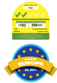
EBD 750 V 7KG AIR VENTED DRYER Made In Europe