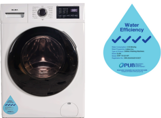
EWF 70120 WP 7KG FRONT LOAD WASHER

Dimensions: W600 x D580 x H850mm Colour: White RCP: $619