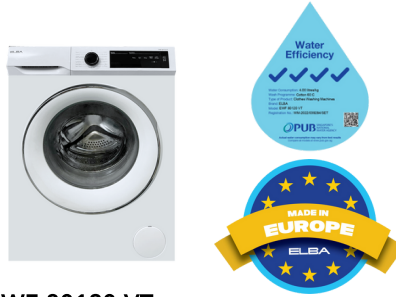
EWF 80120 VT 8KG FRONT LOAD WASHER Made In Europe