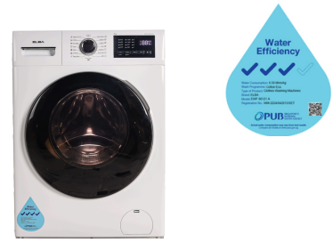
EWF 80121 A 8KG FRONT LOAD WASHER