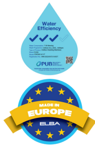
EWF 86141 A 8KG/6KG WASHER/DRYER Made In Europe