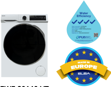
EWF 90140 VT 9KG FRONT LOAD WASHER Made In Europe